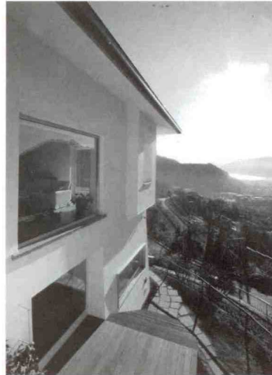
義大利列柯斯秘別墅 Villa Private, Lecco, Italy