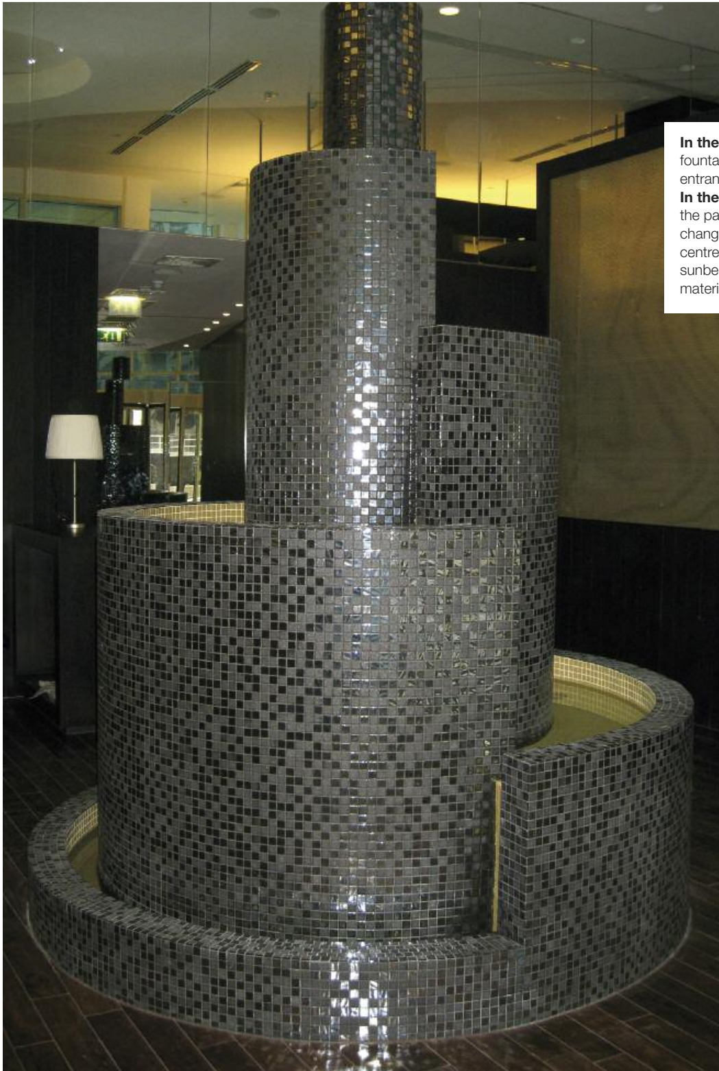
In the large photo , close-up view of the elaborate fountain that welcomes guests alongside the entrance to the restaurant on the ground floor. In the small photos below: left , detail of one of the pathways leading from the swimming pool to the changing rooms, the massage area and the wellness centre; right , the solarium areas equipped with sunbeds. The marble effect created by the ceramic materials is strongly in evidence on the walls.