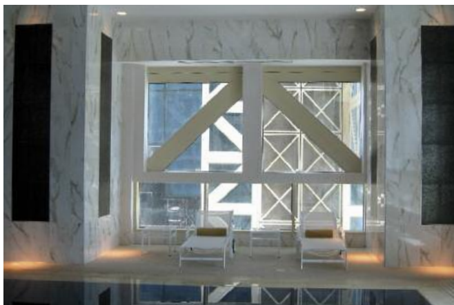
Left , entrance to the male changing rooms from the swimming pool located in the Pure Leisure & Wellness Centre.